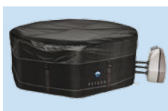
Safe, insulated cover