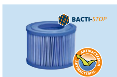
Includes 1 anti-bacterial filter cartridge