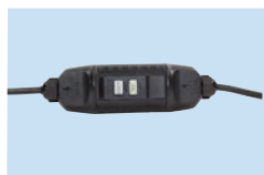
Electrical socket with 10mA differential protection