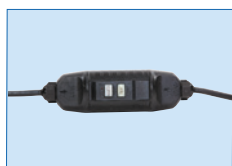
Electric plug with 10 mA differential protection