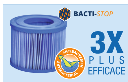
1 Bacti-Stop filtration cartridge included