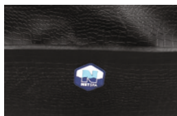
Premium Netspa Boa Texture