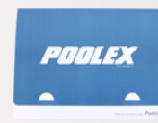
Maintenance kit including multi-language user manual